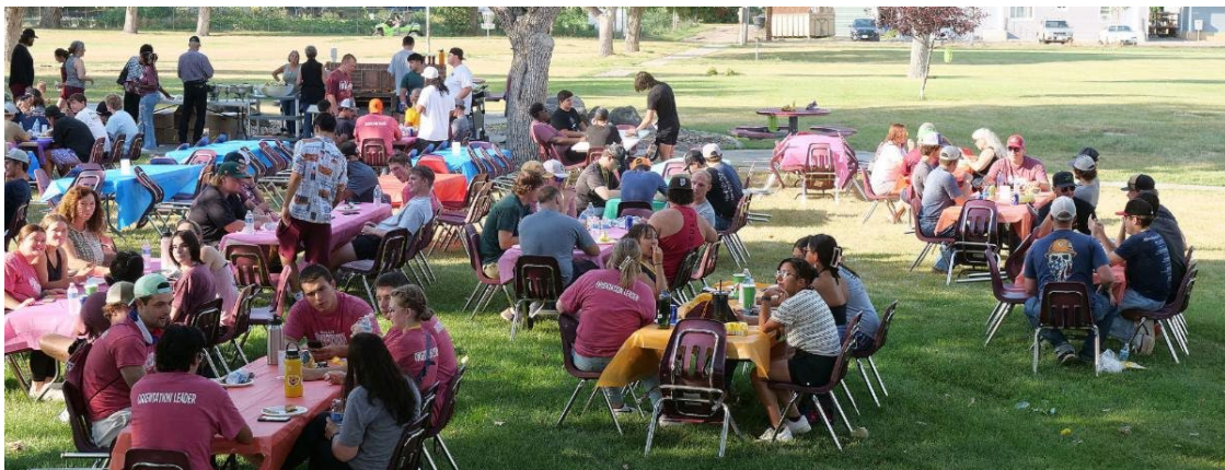
Student enjoy the orientation BBQ