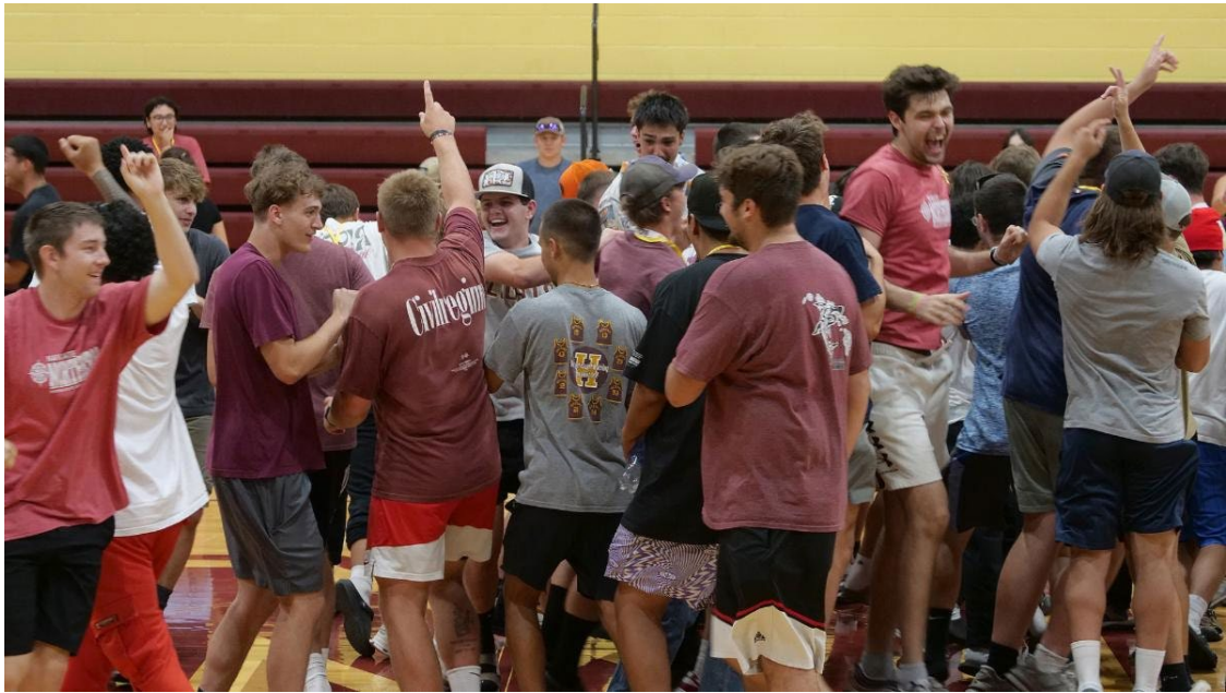
MSU-Northern students enjoyed some Icebreaker activities during orientation