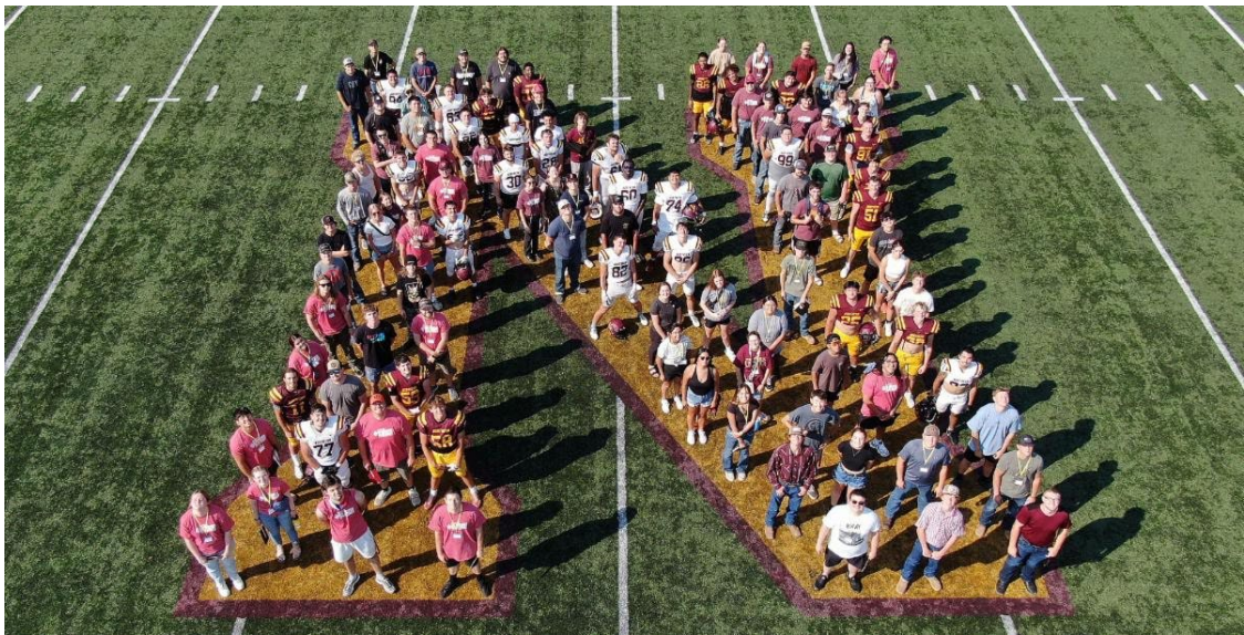
Students take the annual group photo on the N on the football field