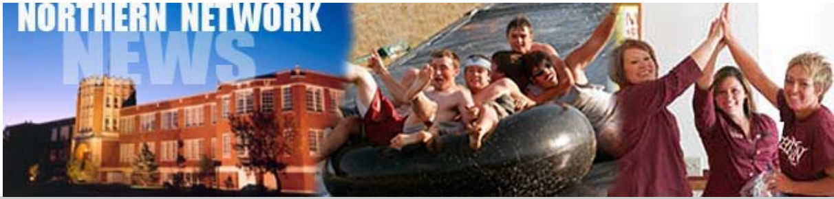
The Official Newsletter For MSU-Northern